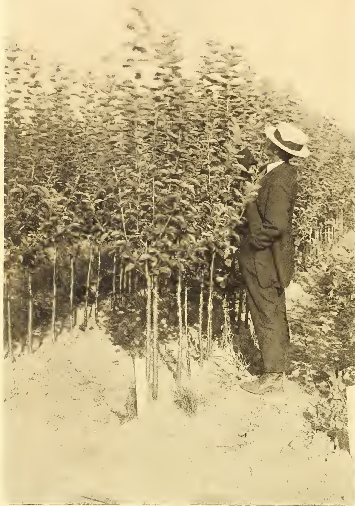
Our Standard Apples